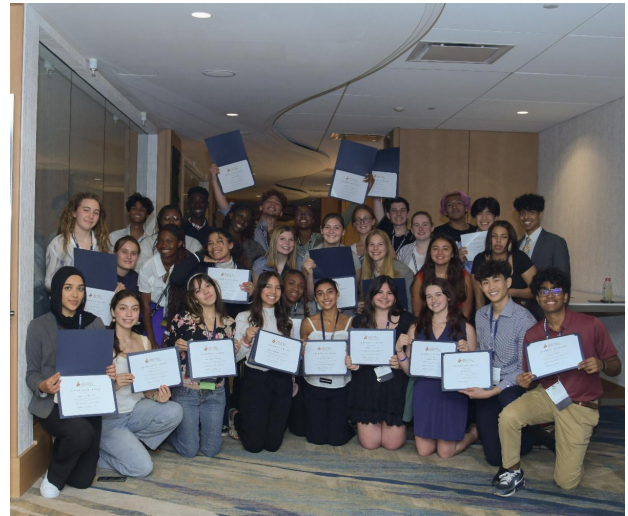
2024 'Be the Change' Program Graduates

Thank you to those who made our 2024 'Be the Change' Youth Training Program a huge success! We had 37 incredible youth attendees from 17 states, eight youth co-led presentations, and 14 total youth presenters. Students attended workshops on various topics, including the importance of social media in marketing school-based health services, innovations in school-based food insecurity programming, fighting mental health stigma, and best practices for effective youth-adult partnerships. Most importantly, youth experienced the power of connecting with and learning from their passionate peers nationwide.