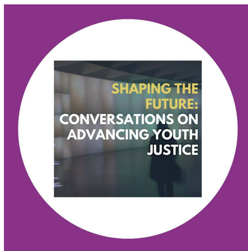
Shaping the Future: Conversations on Advancing Youth Justice